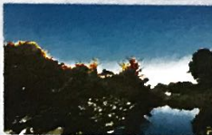
View of the Wall Lake Drain

Did you know that heavy Spring rains that raise lake levels higher into the wetlands allows fish such as walleye to spawn better?