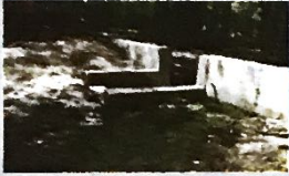
The Wall Lake dam, newly reconstructed in the Spring of 2013

Did you know that heavy Spring rains that raise lake levels higher into the wetlands allows fish such as walleye to spawn better?