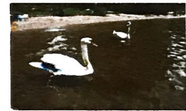
Mute swans on Wall Lake

http://www.michigan.gov/documents/dnr/2012_Mute_Swan_Policy_378701_7.pdf